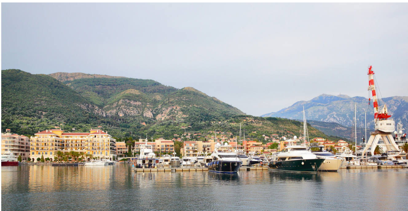
ATS is an Italian shipbuilding company, operating from Viareggio, Italy.

Previously, ATS was working with an entirely manual process, where engineering and fabrication used completely separate systems. Documentation was delivered to the fabricators using drawings in a paper format, sometimes electronically, but in different file formats. The lack of information exchange and integration made revisions and design checks difficult to perform, causing information to be lost during the exchange of documents.