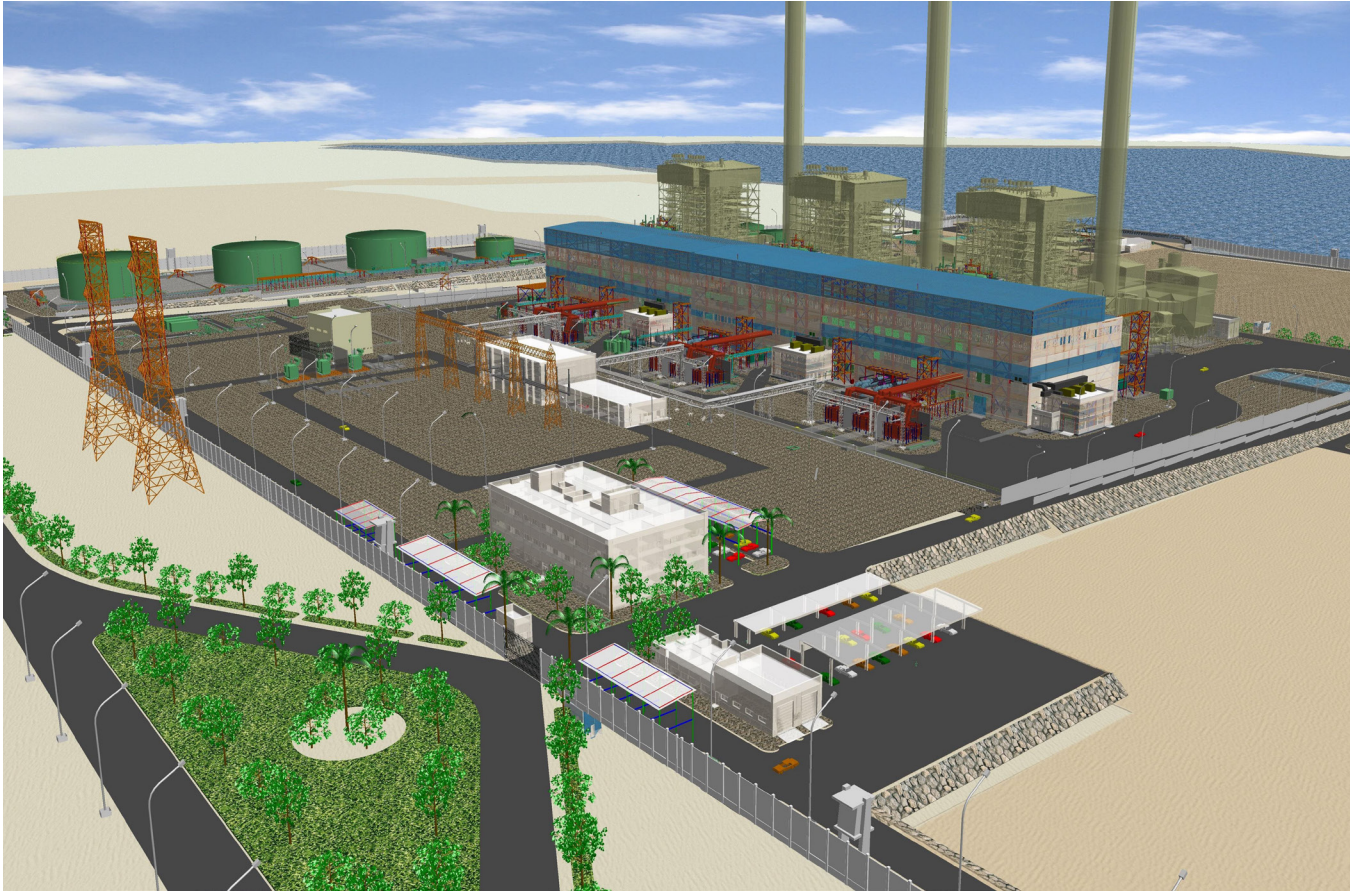
Fig. 1: The aerial view of the South Helwan Power Plant's 3D model, generated using Intergraph Smart Review.