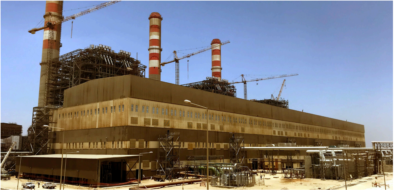
Fig. 4: Actual construction status of the power block area during the South Helwan project indicating that construction activities matched and validated the commodities modeled in Smart 3D.