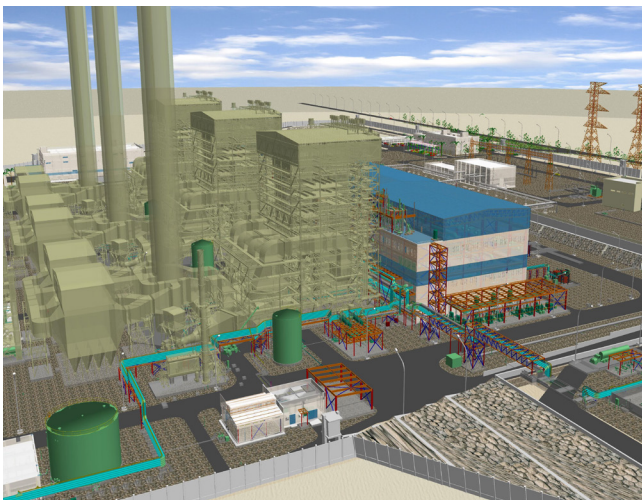
Fig. 2: Power Block Area – the vendor models, such as the steam generators/boilers of the three units, are imported and integrated using the Smart 3D model.

The rule-driven and data-centric nature of the Hexagon products helped PGESCo to improve the overall efficiency of the project delivery. While there were some issues between the integration of the electrical design and Smart 3D, the overall integration between different tools enabled smooth data transfer between different disciplines, supporting better revision control. This in turn allowed PGESCo to eliminate errors to improve the quality of the engineering deliverables.